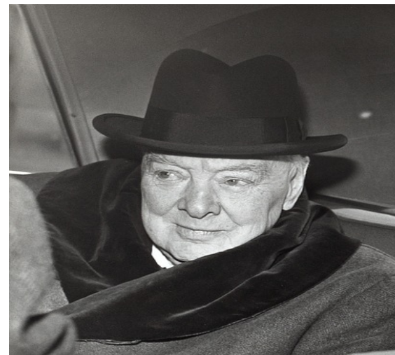
Winston Churchill, 1874-1965

The problem exists for someone who is sick, has no insurance, and needs it. This is a real problem, but only for a very small number of applicants. There are a number of ways to protect these folks – including a high risk pool, as Missouri had for many years until 2014. Another way to protect the uninsurable is to allow portability when they come from a group policy or another state into the individual market or move into another state, but that is a separate discussion. (continued on Page 3)