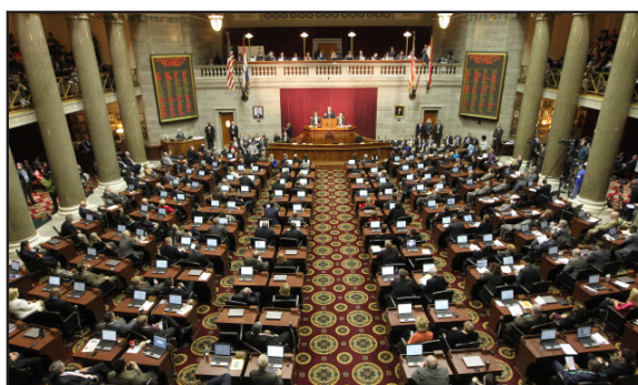
The Truth About MO Legislature

MO, Did Ya Know? is a regular feature of each issue, and is a gathering of information and news not widely known around the state.